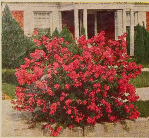
Lovely Crape Myrtle